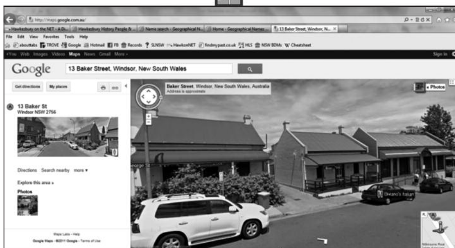
Street View of 13 Baker Street Windsor NSW

A new version of Google Maps has recently been released and are more interactive. For more information about Google Maps, check out http://www.google.com/maps/about/explore/ and also https://support.google.com/maps/ Google Maps can be used for many other aspects of your research. If you do not like the new view you can return to the old Google Maps if you prefer. Go to the new Google Maps, and click the Help button in the bottom right corner. Click Return to classic Google Maps .