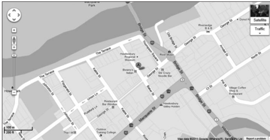
Street View of 13 Baker Street Windsor NSW

Google provides Google Maps which is very useful for family historians. Basically a map service covering the World that you view online at http://maps.google.com.au/ Basic as well as custom maps are available as well as satellite images in many cases. You can obtain directions as well as finding out the distance between localities. You can locate where your ancestor lived and the location of the church they attended. Was it walking distance or would they have had to use another form of transport?